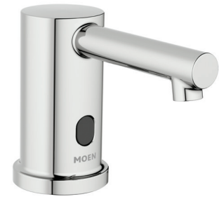
M•Power™ Align® Style Electronic Soap Dispenser